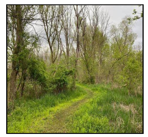
Path in Valle View Reserve